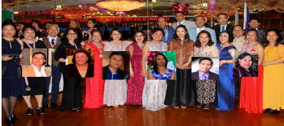
2016-2017 AFTEA, INC. EXECUTIVE BOARD OFFICIALS